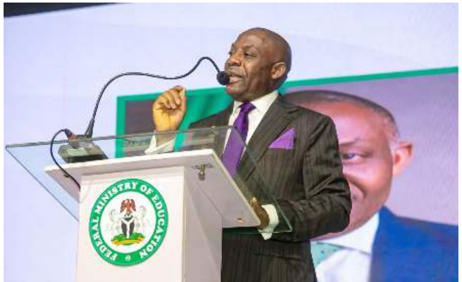
Dr Tunji Alausa, CON, Hon. Minister for Education

Minister of Education, Maruf Tunji Alausa, alongside the Minister of State for Education, Suwaiba Sai'd Ahmad. The Governor of Plateau State, Caleb Mutfwang, is expected to deliver the keynote address.