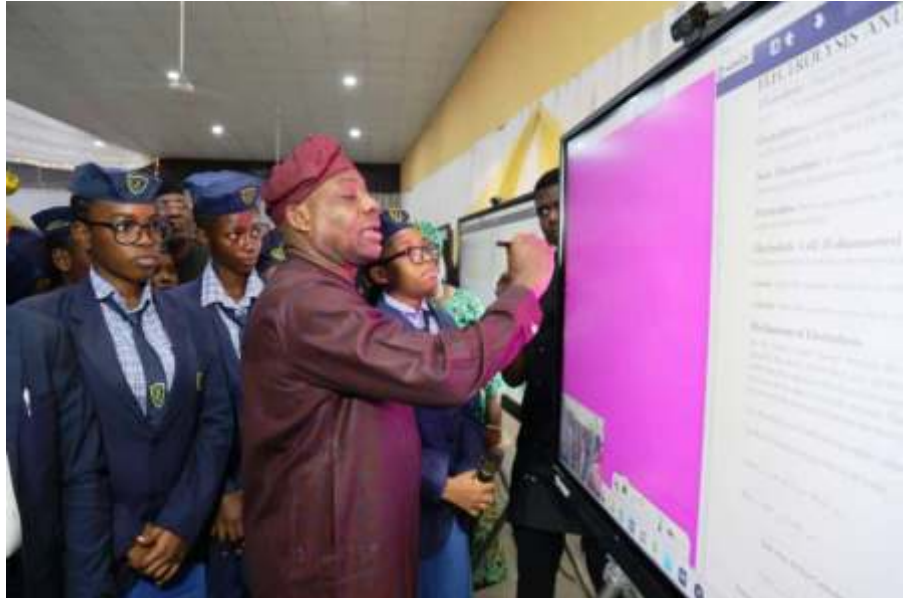
Dr. Tunji Alausa, CON, Hon Minister for Education demonstrating the use of Smart-boards to students at Queens College, Yaba, Lagos.