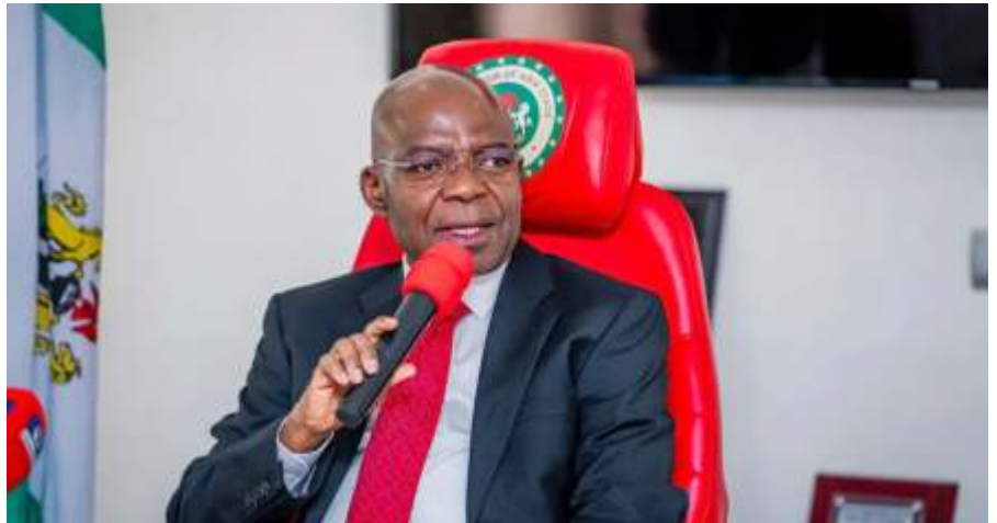
Dr. Alex Otti, OFR, Governor of Abia State.

“With a unique identification number, the progress of every child can be monitored from the point of entry until completion. It will also help us track