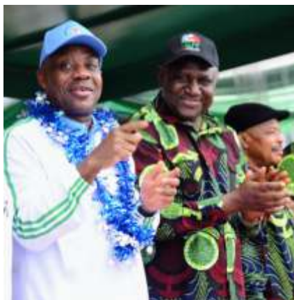
Dr. Tunji Alausa, CON, Hon. Minister of Education. (l) with Comrade Titus Amba, President, National Union of Teachers (Right)

"In case of crisis areas where retired teachers and highly