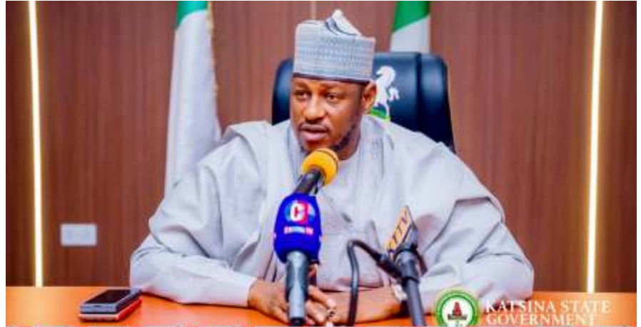
Dr. Dikko Umaru Radda, Governor of Katsina State.