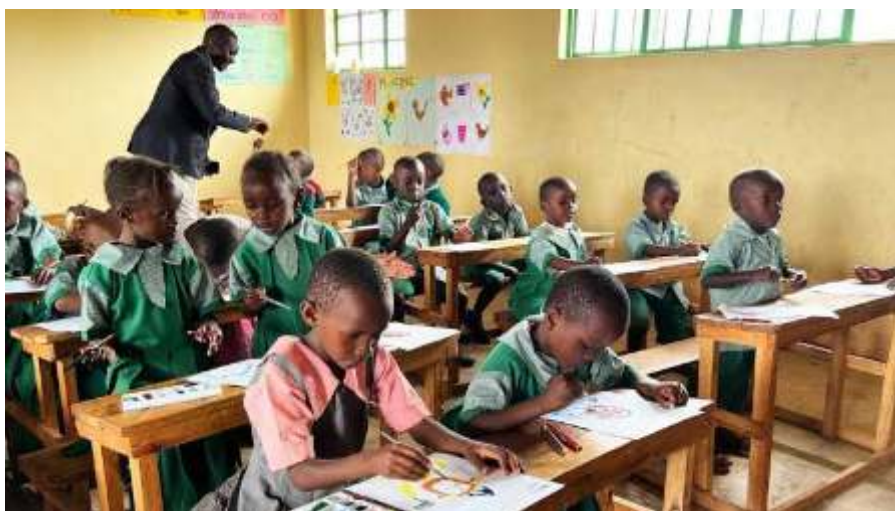
A Cross Section of Learners in Classroom. A place awaits every child.

The government emphasised that collaboration among federal, state, and development partners remains critical to ensuring that every Nigerian child has access to inclusive and quality education.