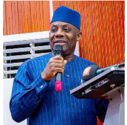
Dr. Tunji Alausa CON, Hon. Minister of Education.

with state authorities to expand school infrastructure to accommodate growing enrolment, while also considering the revival of the national school feeding programme to boost retention in public schools.