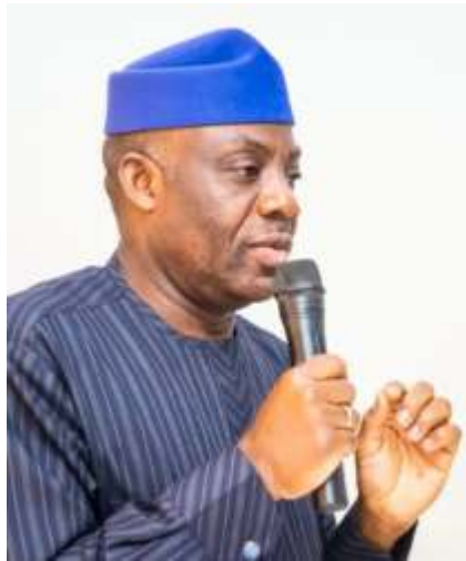
Dr. Tunji Alausa, CON, Hon. Minister of Education.

No teacher will stand before a Nigerian classroom without TRCN registration and licensing," the Minister declared, underscoring the government's resolve to eliminate unqualified personnel and restore integrity to the teaching profession.