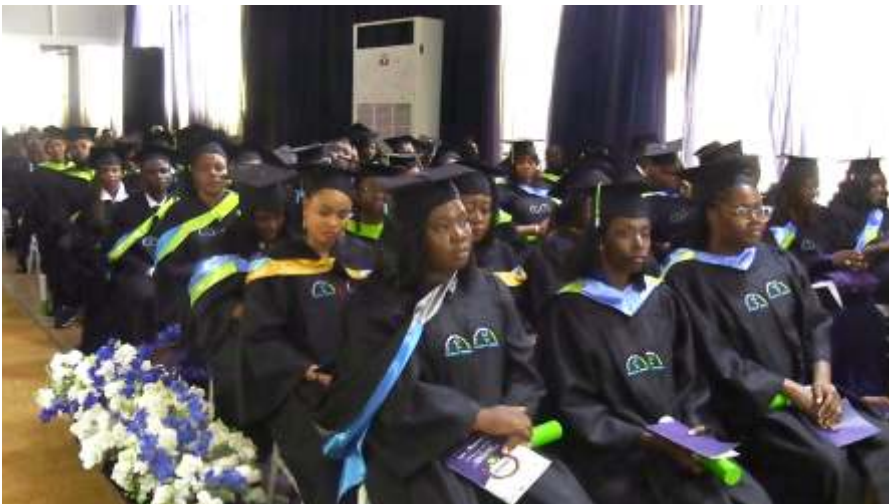
Cross Section of Meadow Hall College of Education Graduates waiting to be admitted to the league of professional teachers.

The ceremony concluded with a renewed call for innovation, dedication, and unwavering commitment to the teaching profession as a key driver of national progress.