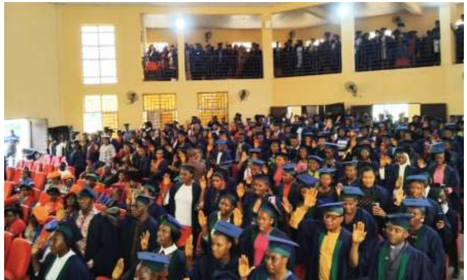
A large number of graduates at a TRCN Induction Ceremony..... A testament to the strong drive of the Council to professionalize teaching in Nigeria.

The Renaissance brought humanist ideals into the fold. Universities such as Oxford and Cambridge introduced elaborate processions, speeches, and the formal conferral of degrees. By the