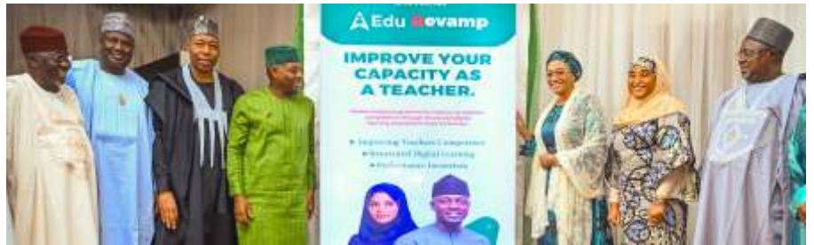
H.E. Senator Oluremi Tinubu, CON, First Lady of Nigeria (3rd R); H.E. Prof. Babagana Zulum, CON, Governor of Borno State, (3rd L); Dr. Tunji Alausa, CON, Hon. Minister of Education (4th L); Prof. Suwaba Ahmed, Hon. Minister of State for Education (2nd R) at the unveiling of the EduRevamp Portal in Abuja.

The Minister of Education, Maruf Tunji Alausa, disclosed that 12