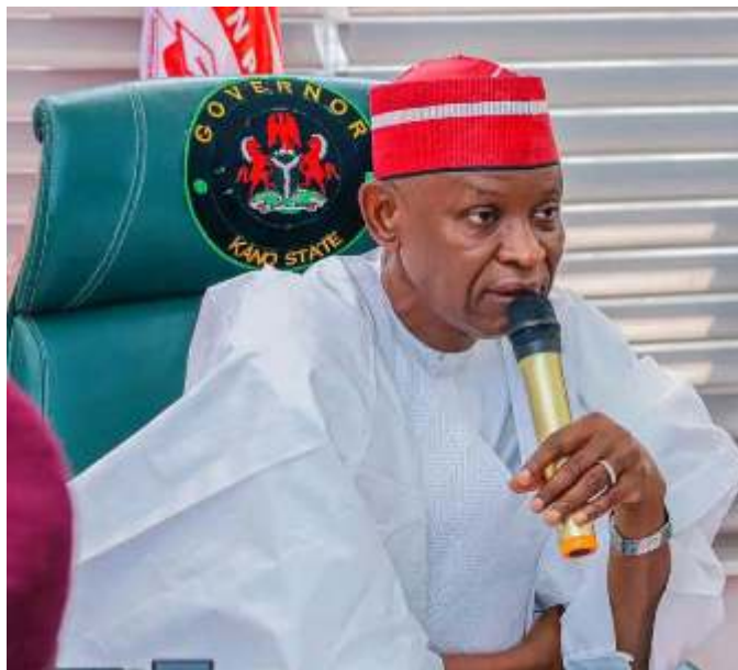
Alhaji Abba Kabir Yusuf, Executive Governor of Kano State

In addition, he said the Governor also approved the engagement of 3,688 qualified