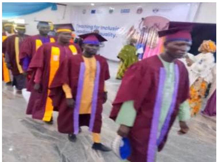
Newly Certified and Registered Teachers Marching into the Hall for the Induction Ceremony.