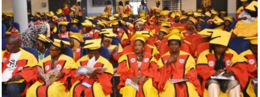
Cross Section of LASUED Graduates waiting for the administration of the TRCN Professional Oath. An important process of being recognized as a qualified teacher.

According to her, the collaboration between LASUED and TRCN plays a pivotal role in safeguarding the integrity of the teaching profession.