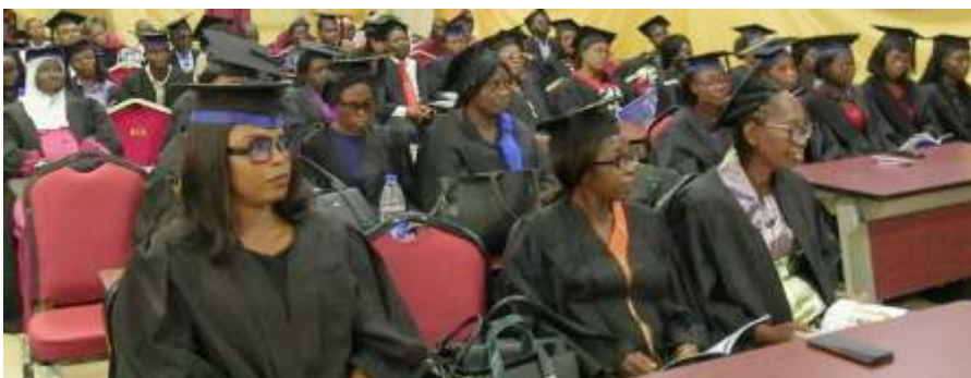
A cross section of graduands at the School of Education and Humanities, Department of Education, Babcock University at the 6th TRCN Induction Ceremony.