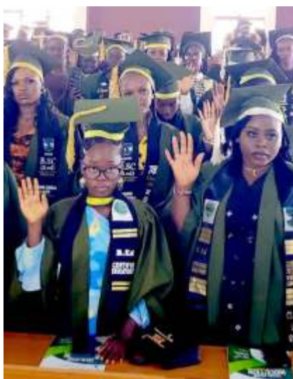
Oath-taking of the inductees of UNN

The three-day induction ceremony was widely regarded as a significant step in strengthening teacher professionalism and advancing education standards in Enugu State and beyond.