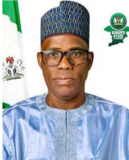
Prof. Ahmad Ladan Ala, Sokoto State Commissioner for Basic & Secondary Education

He highlighted the implementation of long-overdue promotions and the upward review of the minimum wage from ₦18,000 to ₦70,000 as key reforms that have rekindled motivation among teachers.