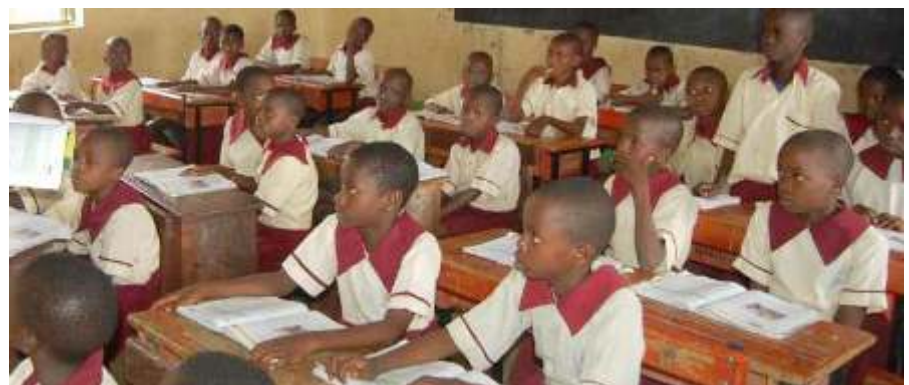
Young Learners in the classroom.... ultimate beneficiaries of the Digital Initiative

As part of broader reforms, the Federal Government is working