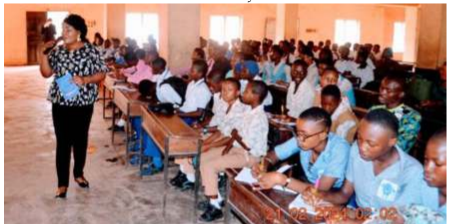
Cross Section of Learners in Katsina State, beneficiaries of the Safe School Drive Policy

The initiative underscores Katsina State's renewed commitment, alongside its development partners, to ensuring safe, secure, and violence-free schools that support learning and protect every child in the education system.