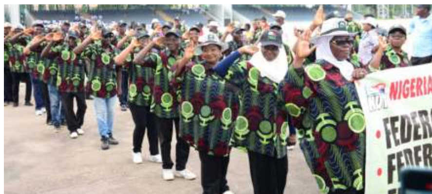
Members of the National Union of Teachers on parade at Eagle Square, Abuja.